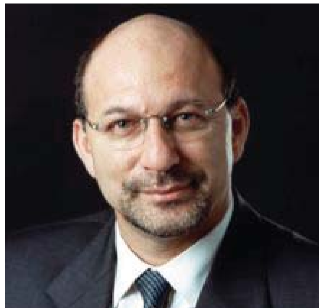
Trevor Manuel, former finance minister, now minister in the presidency - national planning commission

The full list in alphabetical order below; the deputy President is Kgalema Petros Motlanthe.