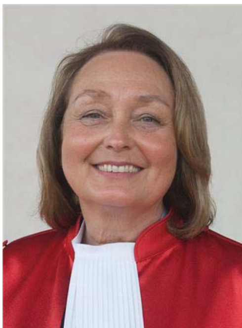
Justice Shireen Avis Fisher

Since '86, she also served as a judge of general jurisdiction trial courts (criminal, civil and family courts) in the US state of Vermont, currently with active-retired status.