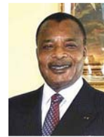
President Omar Bongo Ondimba (Left) & President Denis Sassou N'Guesso

of a judicial investigation and the nomination of an investigating judge. This judge will have to determine how the assets owned in France were acquired, and where the funds in the many bank accounts uncovered during a preliminary police investigation came from.