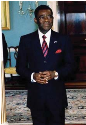
President Teodoro Obiang Mbasogo

The case filed in Dec '08 called for French authorities