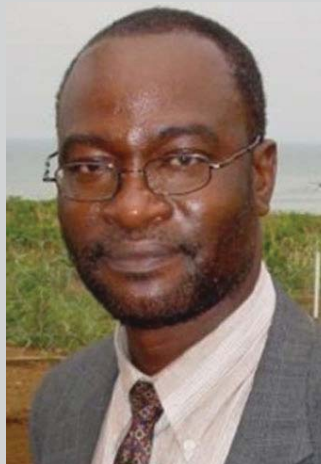
Samura Kamara - Sierra Leone's finance minister

The meeting follows the G20 summit early April in London where world leaders met and agreed to bolster